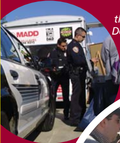
Members of the Visalia Police Department were on hand to demonstrate breathalyzer tests.