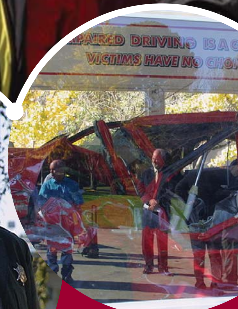
The late Casey Goodwin's vehicle, used to show the damaging and deadly effect of DUI.