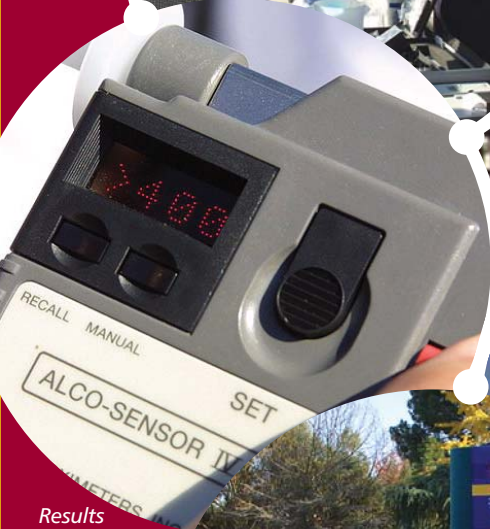
Results of the breathalyzer test.