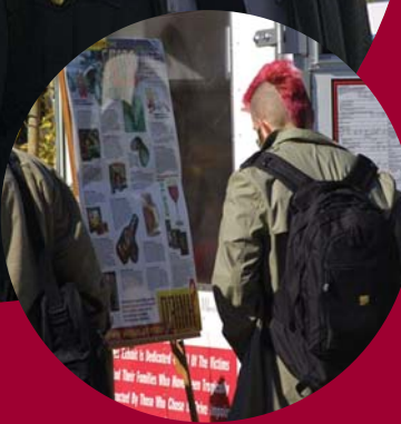
A COS Student intently looking at a MADD exhibit