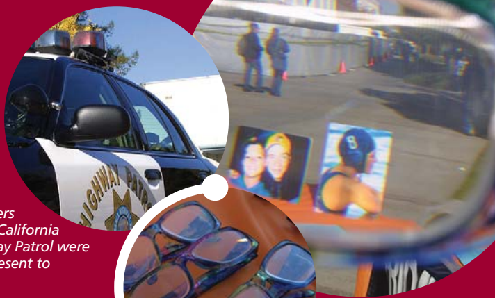
Members of the California Highway Patrol were also present to