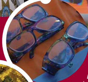
Friday Night Live gave visitors the opportunity to wear DUI goggles which simulate impaired vision.