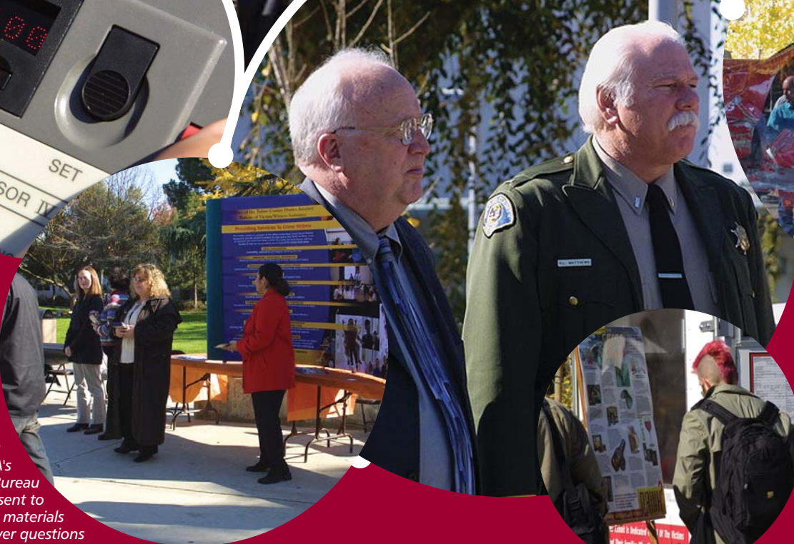
Members of the DA's Victim's Bureau were present to hand out materials and answer questions about their services.